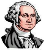
Mount Vernon Chapter

Dedicated to the memory of General George Washington